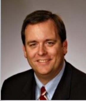
October Meeting Presenter

Lunch includes your choice of one of the following meal selections: